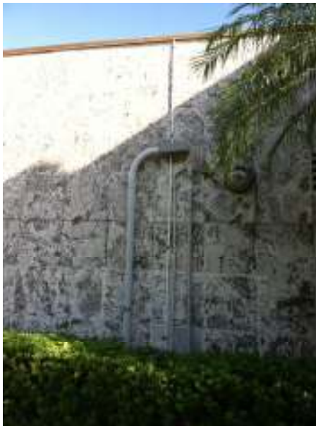
Council Chambers Conduit