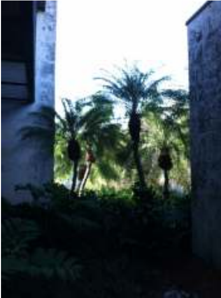
Separation between buildings